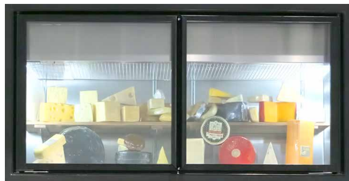
Double Half Doors Shown

All STYLELINE ® doors are DOE compliant.