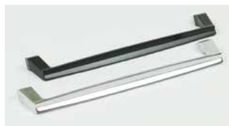
Standard Handle Finishes